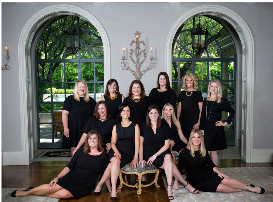
2019-2020 Board of Directors