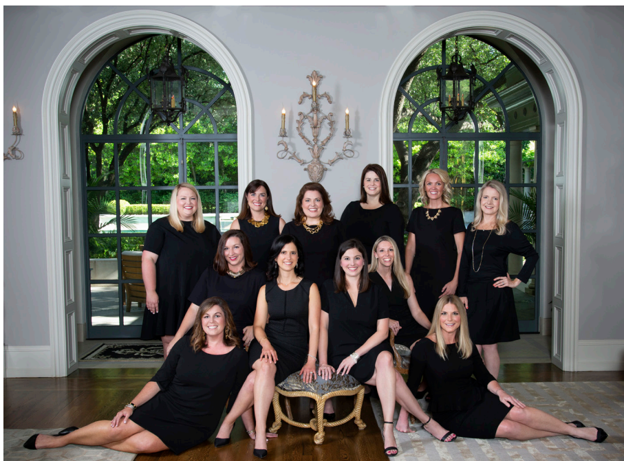
2019-2020 Board of Directors