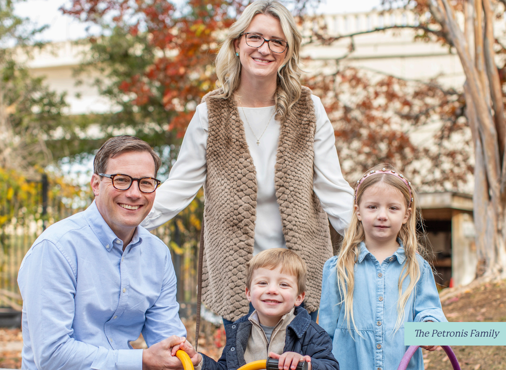
The Petronis Family