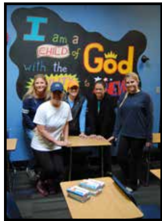
Fortress Youth Development Center