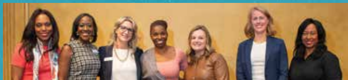
PANALISTS + BOARD MEMBERS